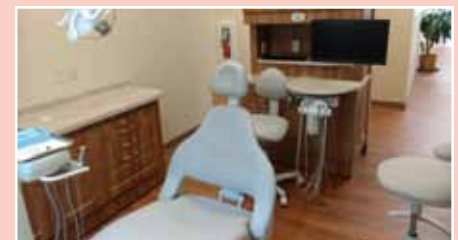
Photo: One of four new operatories complete with state-of-the-art equipment at Pike Dental Center.

As part of its mission as a FQHC, WMCHC provides an estimated half million dollars annually in free and reduced-cost dental services between its two dental sites by utilizing a sliding-fee scale program for patients who qualify.