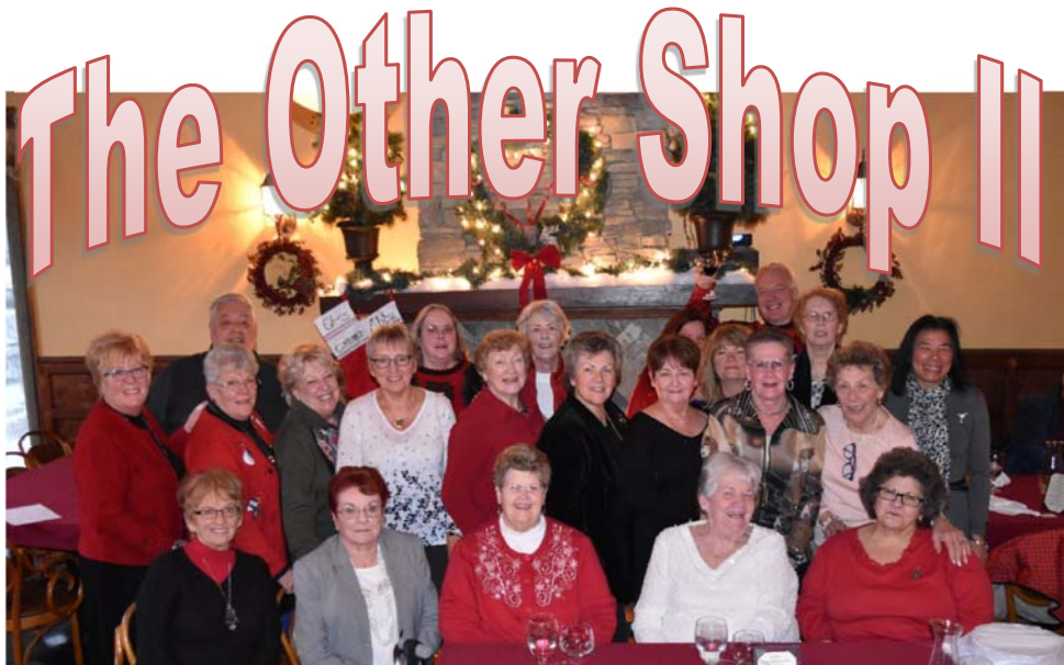
Enjoying their annual Christmas Luncheon, December 17, 2017 at Ridge Restaurant, Hawley