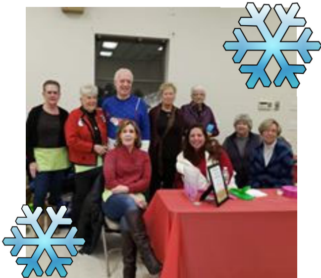
Pictured above - Tricky Tray Committee