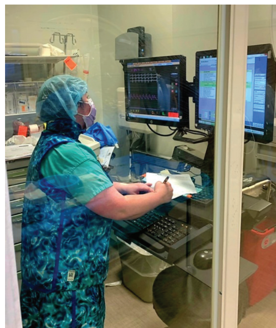
Figure 11. Mobile shielding.

If we do a femoral case, the physician will close the access site with an Angio-Seal VIP (Terumo). If the femoral artery is too diseased, the techs pull the sheath using a hemostasis pad (QuickClot Interventional). This occurs in our pre/post-op area. All techs are trained for sheath pull during orientation. There is a policy in place for sheath removal competency. The staff members must first observe a minimum of 2 sheath pulls and 5 supervised sheath pulls with a preceptor. After that, they must independently remove an arterial sheath, observe the extremity for signs of complication, verbalize understanding of potential complications and potential patient responses to sheath removal, and document sheath removal and patient response. IABP catheters are pulled and held by the physician’s assistant. For young staff coming into the field, this proves to be a challenge, as femoral cases are less likely to be performed and when femoral