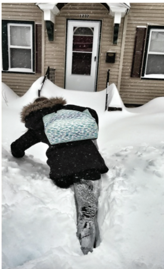
Figure 16. Attempting to get into the on-call house after a snowstorm.

Can you share some data about your lab's door-to-balloon (DTB) times and some of the ways employees at your facility have worked together in order to lower your DTB times?