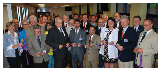
Figure 4. Cutting the ribbon for our new program!