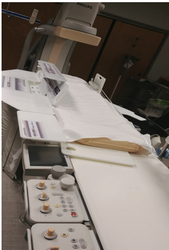
Figure 10. Cardio-TRAP radial shield (Trans-Radial Solutions, LLC).

In our cath lab, we currently are at 92% radial access. We follow Society for Cardiovascular Angiography and Interventions (SCAI) best practice recommendations for “radial first” (vascular ultrasound). This better allows for same-day discharge for many of our patients. Radial access has been shown to have a lower complication rate versus a femoral approach. The radial approach has also proven to be cost effective, not only in supporting earlier discharge, but also in eliminating the high cost of femoral closure devices.