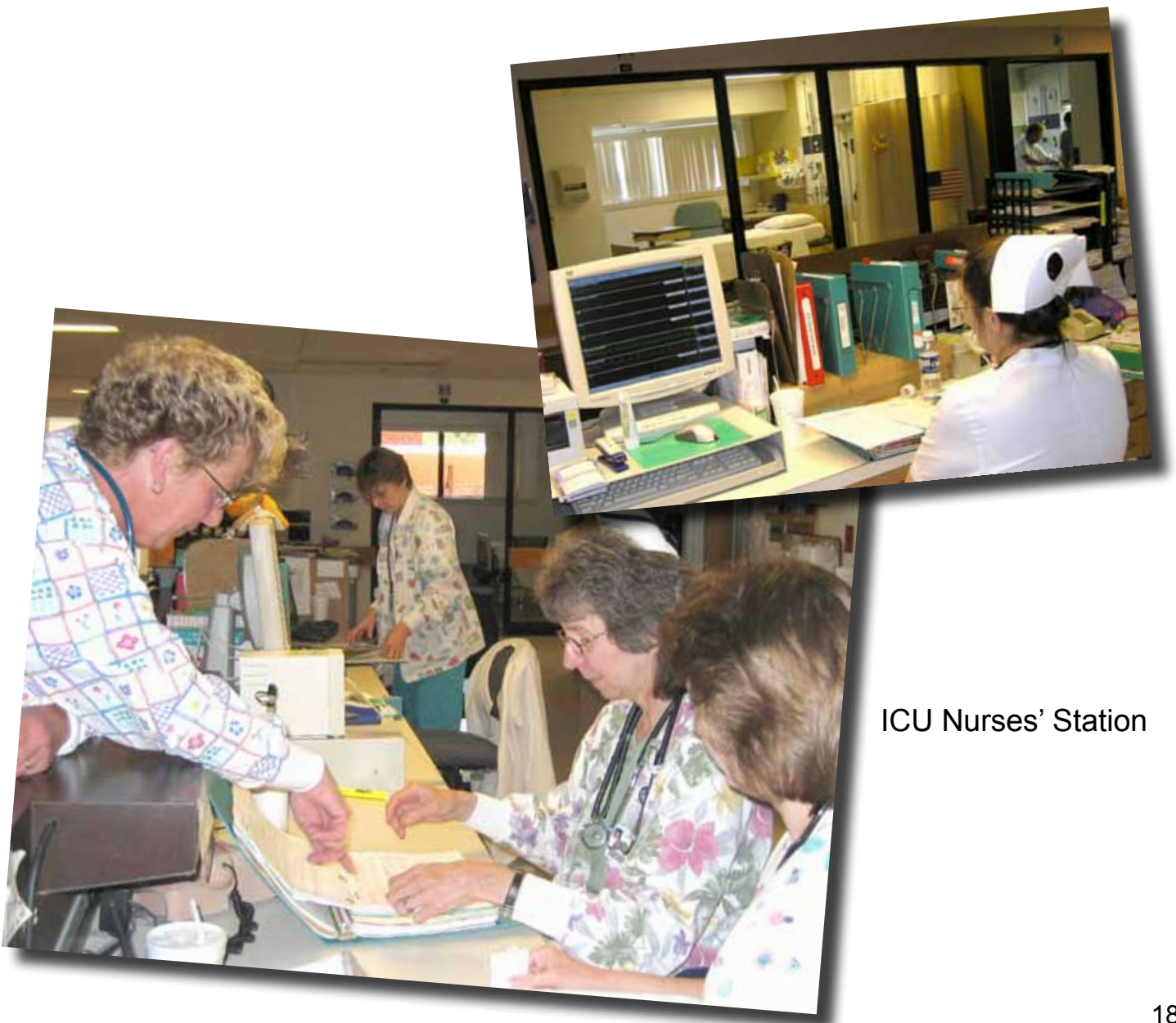
ICU Nurses' Station

We hope you are always given very good, “top notch” care and excellent service during this hospital stay. If you are not able to definitely recommend Wayne Memorial as a result of your experience, please tell us what we can do now to make your visit more satisfactory. Please let everyone know how good your experience was at the Hospital and be sure to complete a survey if sent to you.