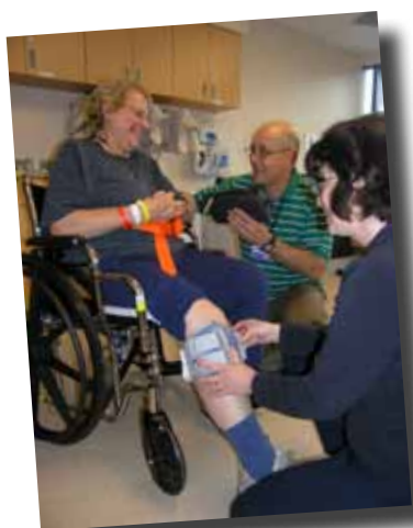
Good Shepherd Inpatient Rehabilitation

A specially designed facility where sleep studies, called polysomnograms, are conducted to diagnose up to 85 different sleep disorders in adults.